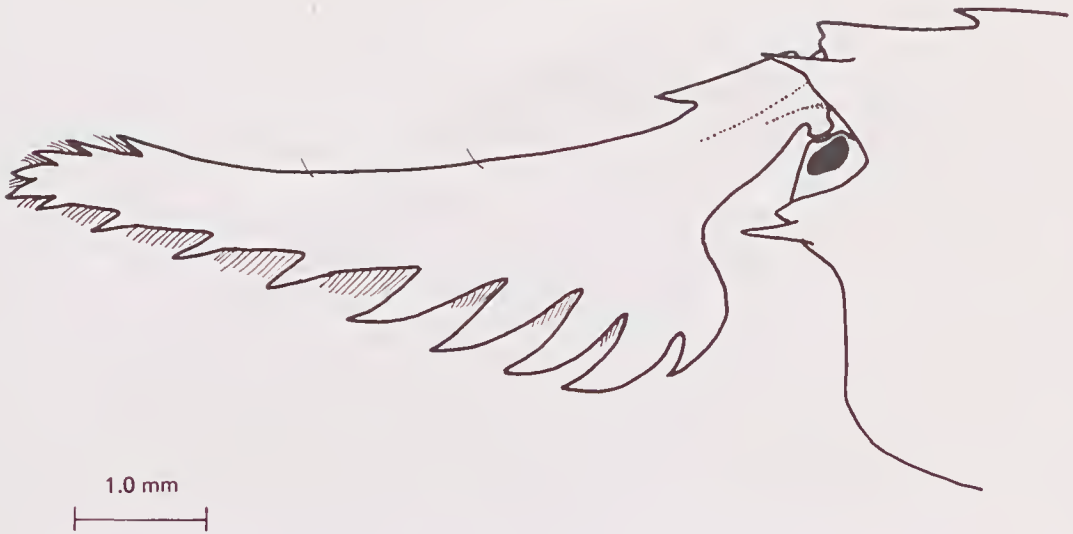
Fig. 1. Rhynchocinetes balssi Gordon: ♂, CL 4.3mm, rostrum.